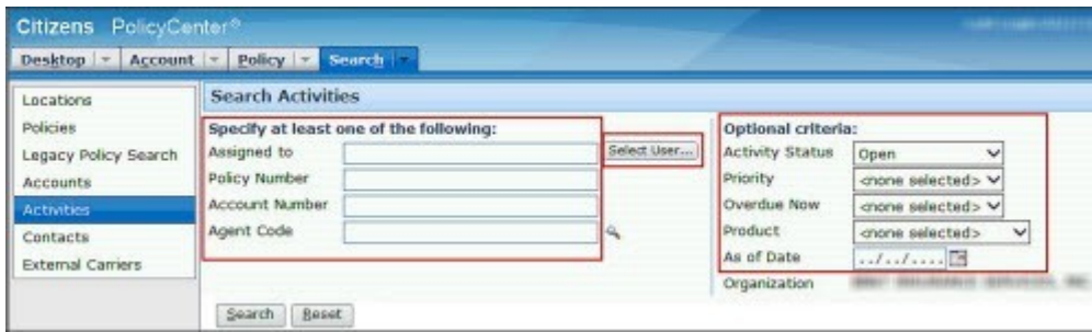
Figure 2: Search Activities screen