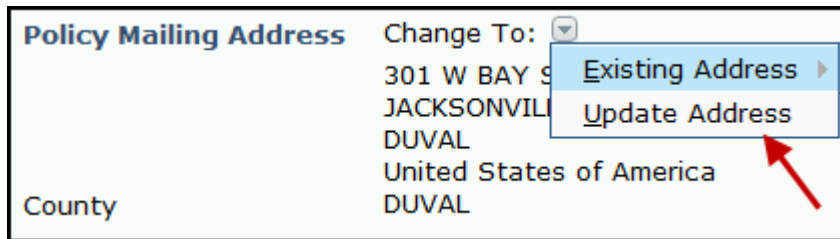
Figure 3: New Change To: drop-down options in the Policy Mailing Address section

This system update allows PolicyCenter to set the first named insured's primary mailing address with data to match the edited Policy Mailing Address data.