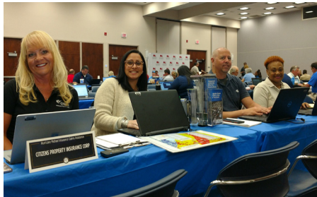
Employee representatives on site at DFS Insurance Village held Gulf Coast State College in Panama City.

Jacksonville, FL – Whether it’s preparing for the 2019 hurricane season or handling claims from Hurricane Michael, Citizens staff members are willing and able to respond.