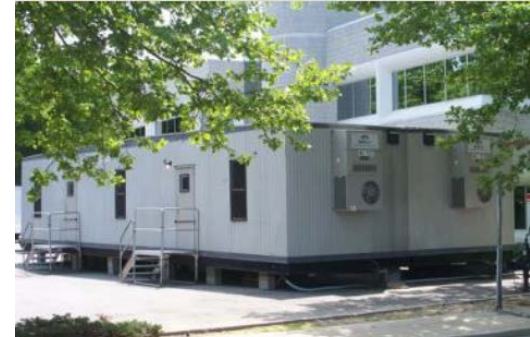
Mobile Office Solution