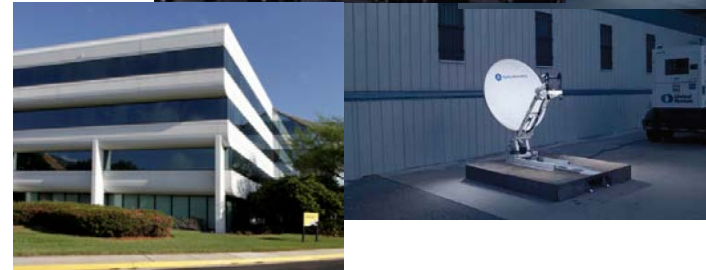
Physical Office Solution