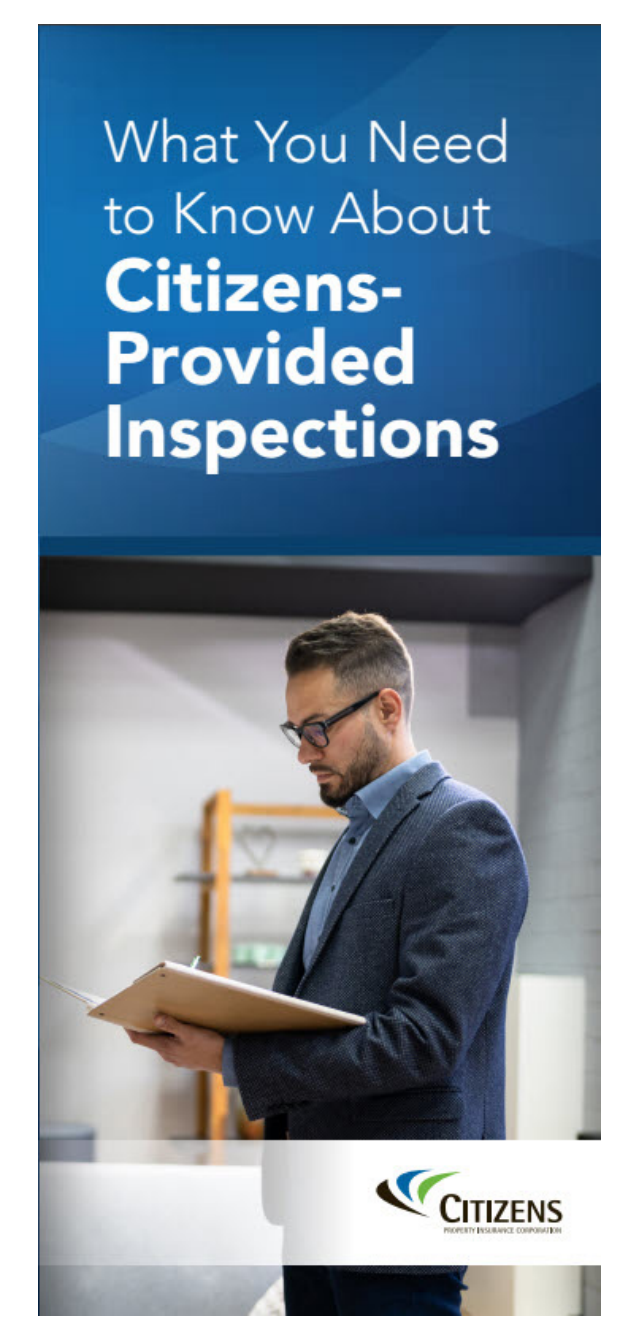
Click image for full brochure.

These free inspections may help policyholders avoid major problems in the future by verifying that their property meets minimum underwriting guidelines and brings Citizens closer to private market standards. Agents will be there to assist customers throughout the process, and we're also here to help.