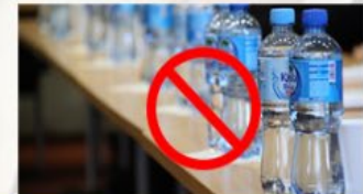
Bottled water and coffee