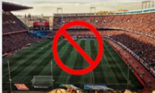
Tickets to sporting events