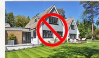
Lodging in private residence